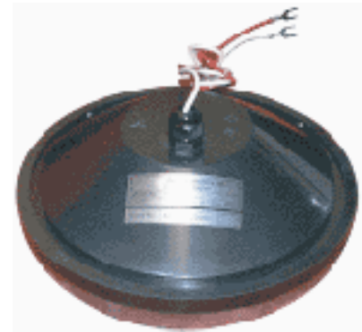
Type 1 connection